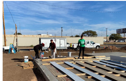
Amarillo Association of REALTORS volunteers