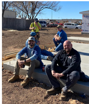
Premier Truck Group volunteers