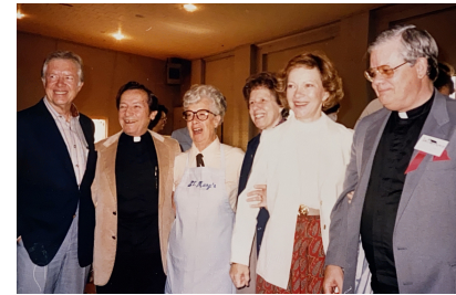
The Carters at a luncheon

Since our incorporation in 1981, Amarillo Habitat has been bringing people together to build strength, stability and self-reliance through affordable homeownership opportunities. Take a look back at the last 40 years of decent, affordable shelter right here in Amarillo.