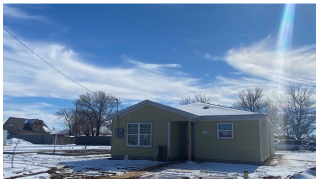
Two homes under construction