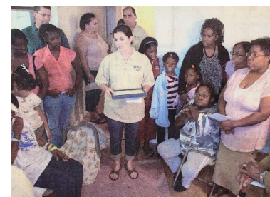
Celebrating the last homes at Habitat Hill

2007 The Amarillo Habitat ReStore opens (the 28th in Texas) 33rd and final home completed at Habitat Hill