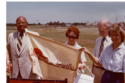
Habitat Hill land dedication

Amarillo Habitat receives the deed for the land that would become Habitat Hill