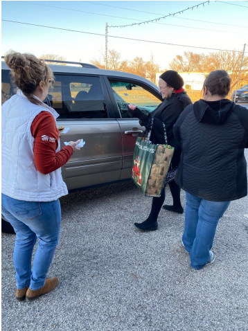
Drive-by Christmas Party