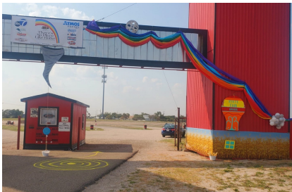
There's No Place Like Home drive-in movie fundraiser