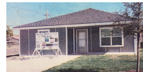
The 100th home

2014 Amarillo Habitat completes 100th home