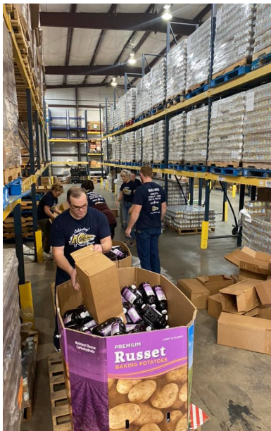
Volunteering at High Plains Food Bank