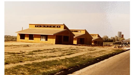
The first three homes

1988 10th home completed by Amarillo Habitat