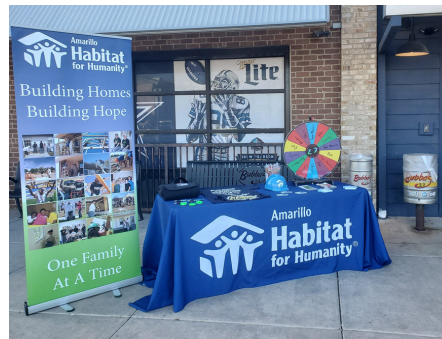
Celebrating World Habitat Day at Bubba's 33